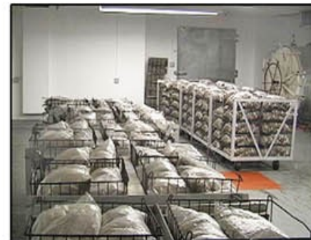
3. Substrate cooling in sterile air