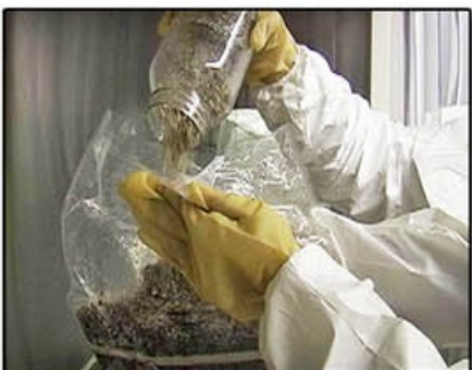
4. Inoculating the substrate