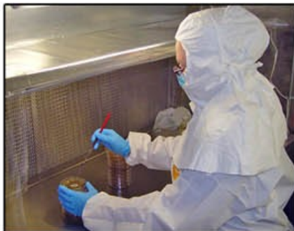
2. Transferring culture to inoculum