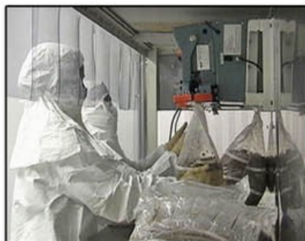
5. All work done in sterile air environment