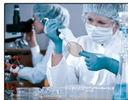
9. Quality Control

Ganoderma - Reishi - Ploverotus - Oyster - Cordyceps - Hericium - Lions Mane Over 100 species of medicinal mushrooms available.