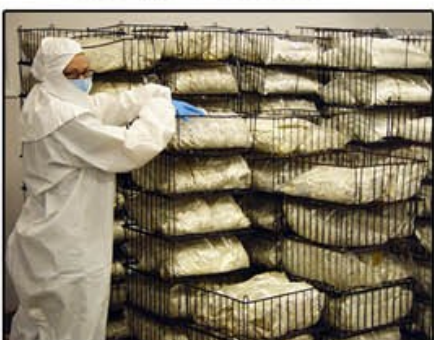
7. Growing in Sterile Environment