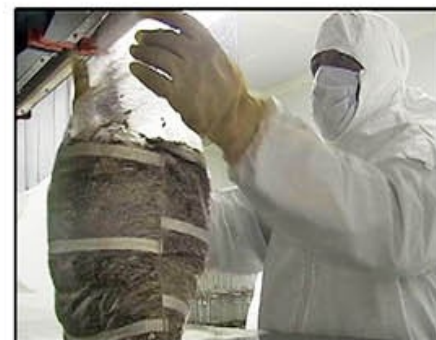
6. Hermetically sealed growing bags