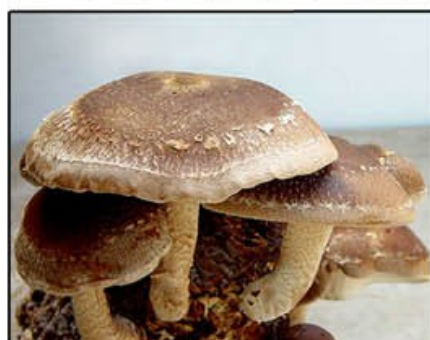
8. Ready to Harvest